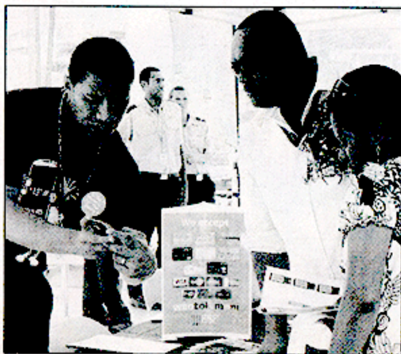
CUSTOMERS learning more about BSP products

VOTED INTERNATIONAL PICKUP DI THE YEAR 2012-13